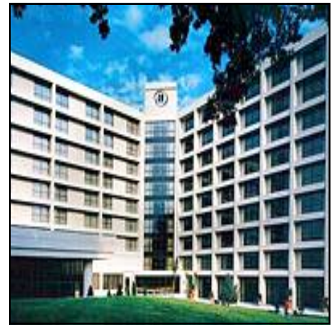
A view of the St. Louis Airport Hilton at 10330 Natural Bridge Road., St. Louis, Missouri.

Members other than the recorded sage, third counselor, chapter director, province archon, or elected alumni club delegate must provide a $75 registration fee prior to securing