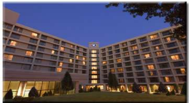
Hilton St. Louis Airport